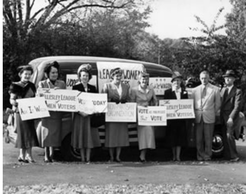
Wellesley League of Women Voters "Ask It" Wagon. October 1948