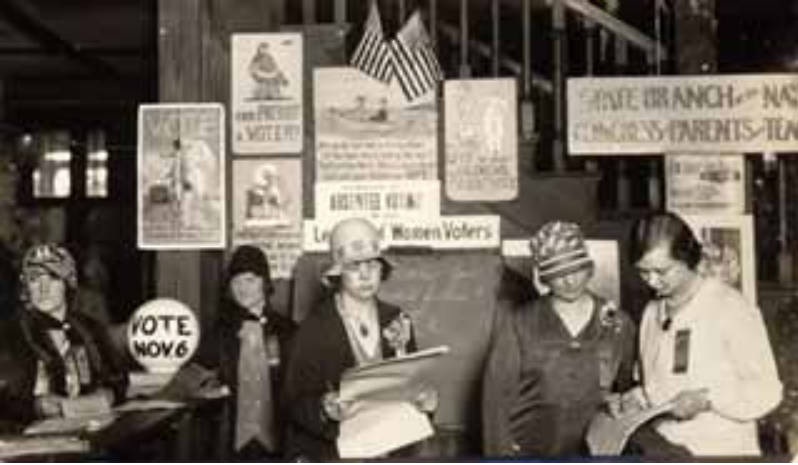
At League Booth at Dakota State Fair (approx. 1924)